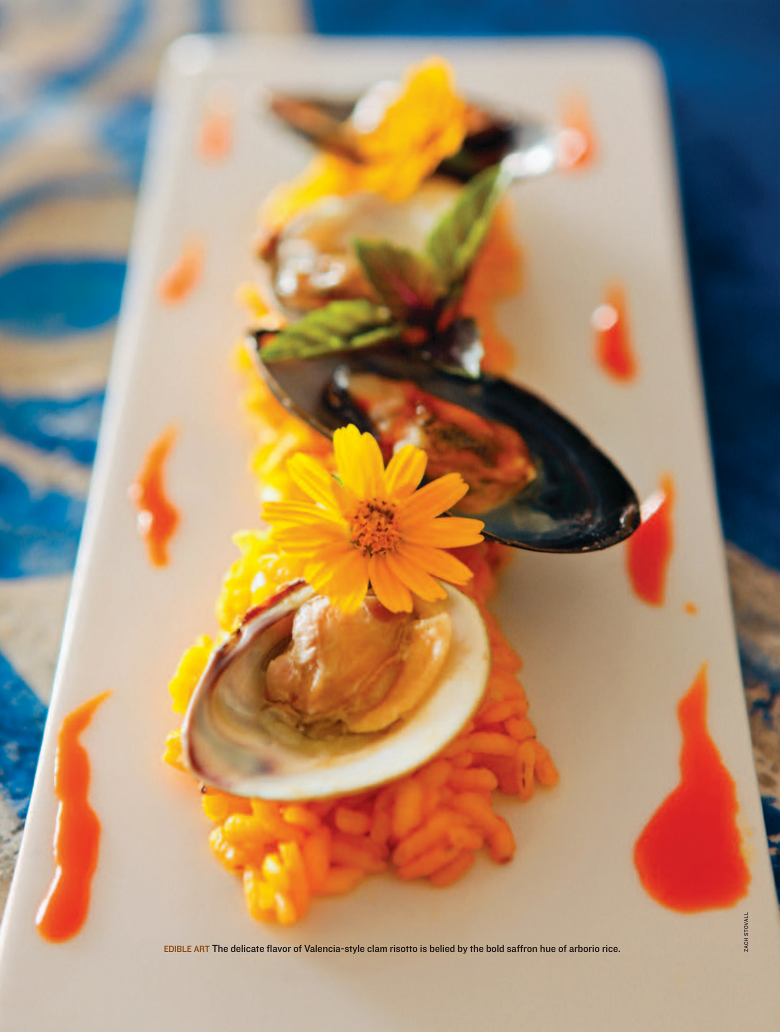
EDIBLE ART The delicate flavor of Valencia-style clam risotto is belied by the bold saffron hue of arborio rice.