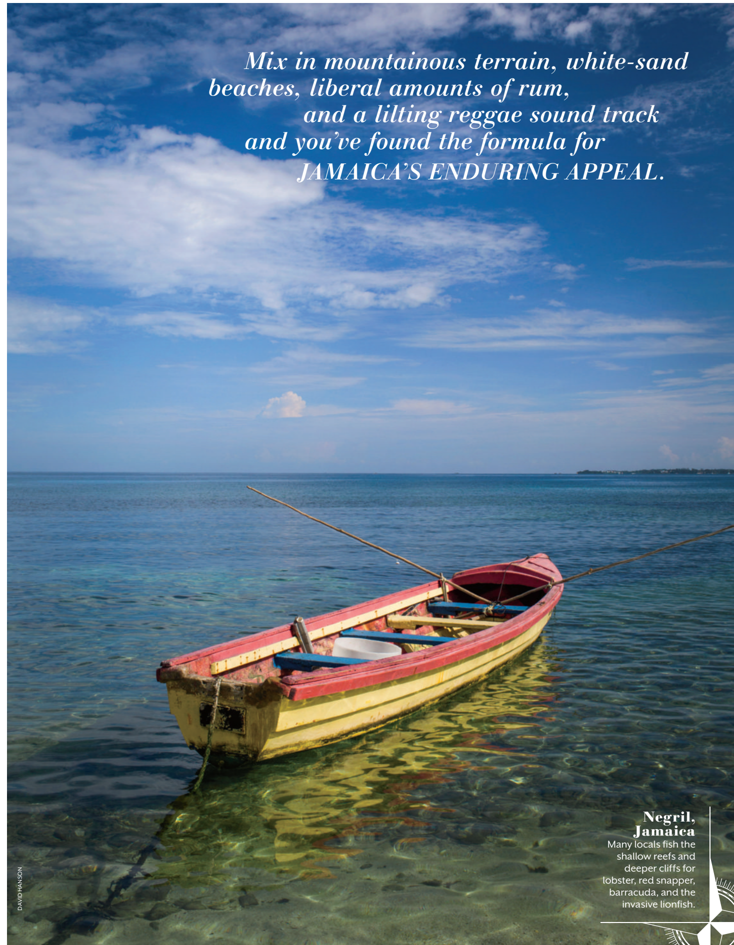
Negril, Jamaica Many locals fish the shallow reefs and deeper cliffs for lobster, red snapper, barracuda, and the invasive lionfish.