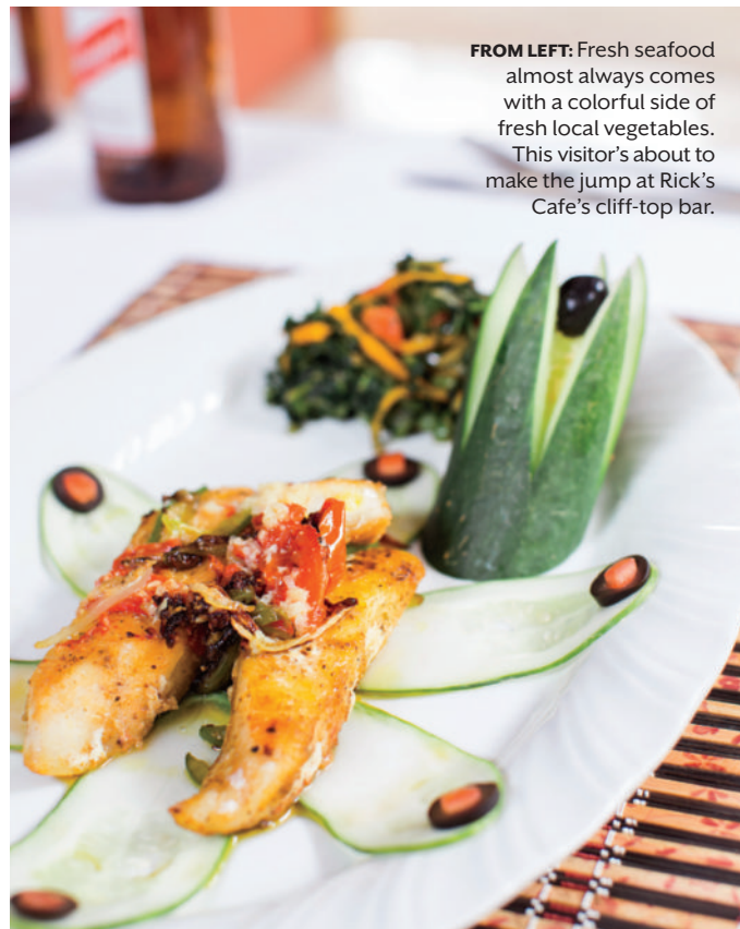
FROM LEFT: Fresh seafood almost always comes with a colorful side of fresh local vegetables. This visitor's about to make the jump at Rick's Cafe's cliff-top bar.