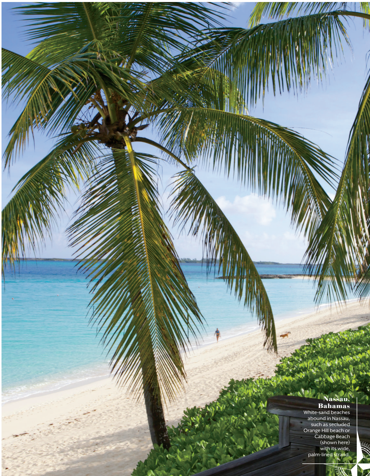
Nassau, Bahamas White-sand beaches abound in Nassau, such as secluded Orange Hill beach or Cabbage Beach (shown here) with its wide, palm-lined strand.