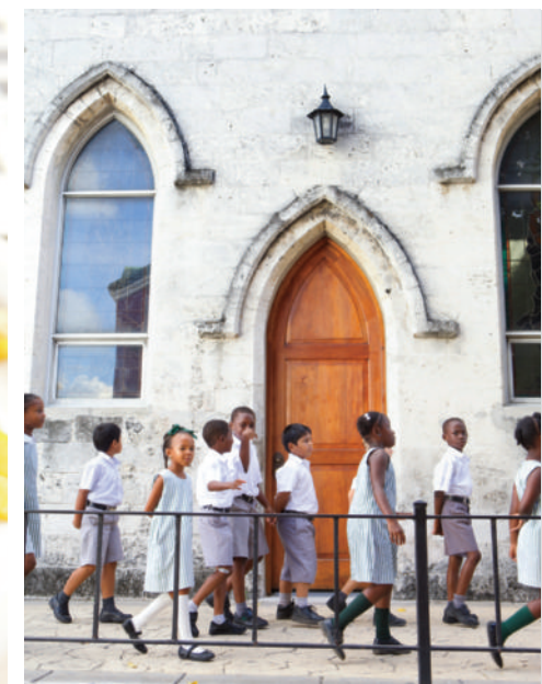
CLOCKWISE FROM LEFT: Grilled spiny lobster at Bahamian Cookin’; a street scene; Comfort Suites; Arawak Cay

Join the interactive tour at Graycliff Chocolatier ( graycliff.com ; $50) to see how the organic chocolates are made, score samples, and then make your own bar of chocolate. Also